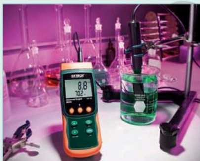
Typical Oxygen measurement applications in lab